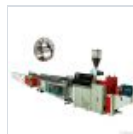
PVC Pipe Production Line